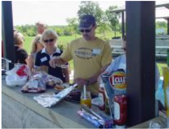
Members and family start through the food line at the ILA Annual Summer Picnic